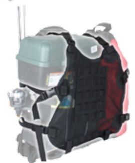
Pack up fishing equipment or gear load outs