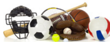
Pack up sporting goods with ease with the Cargo Carrier

Used to attach any pack or load to the Pack Mule™ frame system. Includes adjustable buckles, sliplocks, and webbing.