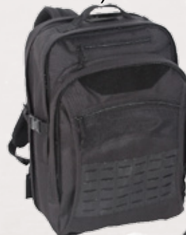
BUGOUT VOYAGER New in 2015 line-up!

SEWN GOODS AND MANUFACTURING SOLUTIONS TO FIT YOUR BUDGET, DELIVERY SCHEDULE, AND REQUIREMENTS.