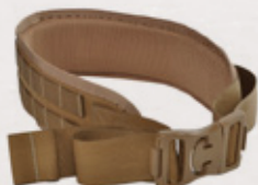
BELTS MOLLE Belt L/XL