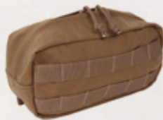
POUCHES General Purpose Pouches