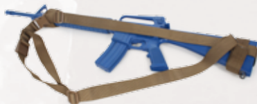
SLINGS Advanced 3-Point Sling