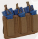
AMMO POUCHES Triple Shingle M16 w/ Pistol Mags