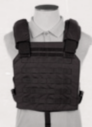
PLATE CARRIERS Quick Reaction Plate Carrier